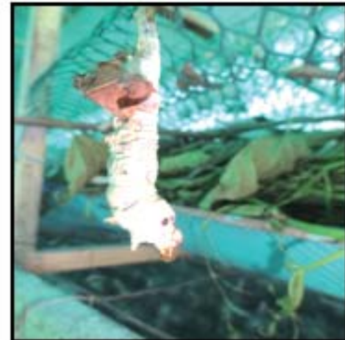
4. Larva hanging upside down