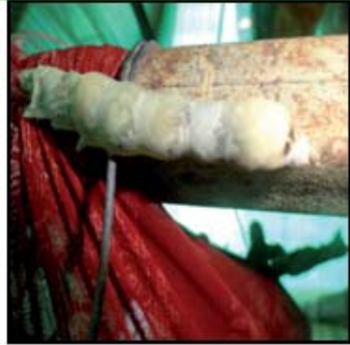
2. Larva with swell intersegments and sluggish appearance