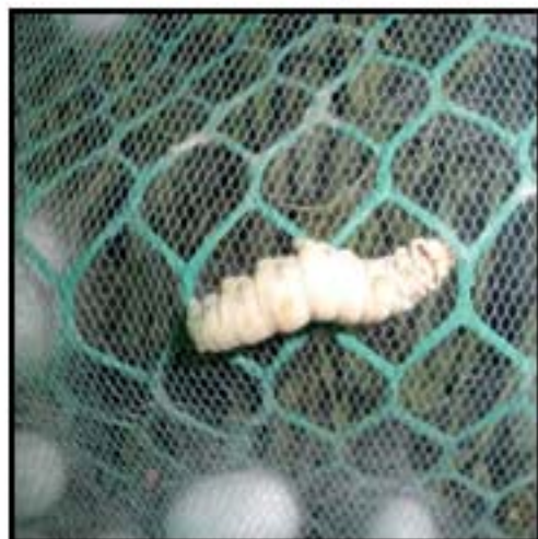
5. Milky white integument ruptured skin