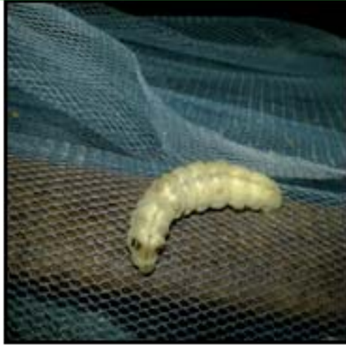
1. Infected larva with oily and shiny skin