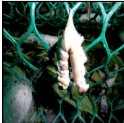
3. Larva with thin and fragile integument