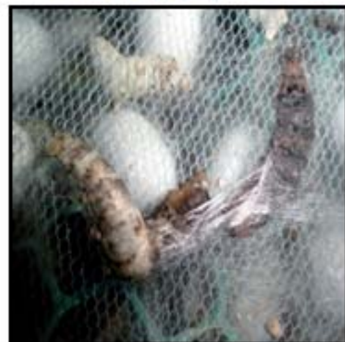
6. Polyhedral bodies oozing out of midgut

PHOTO PLATE-I: Grasserie infected larvae